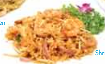
Shrimp Pad Thai