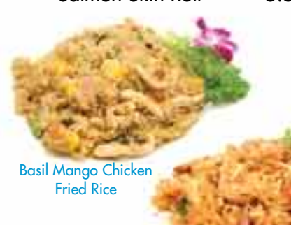
Basil Mango Chicken Fried Rice