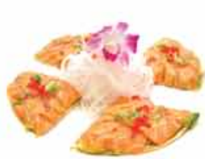
Fuji Pizza (Spicy Salmon)